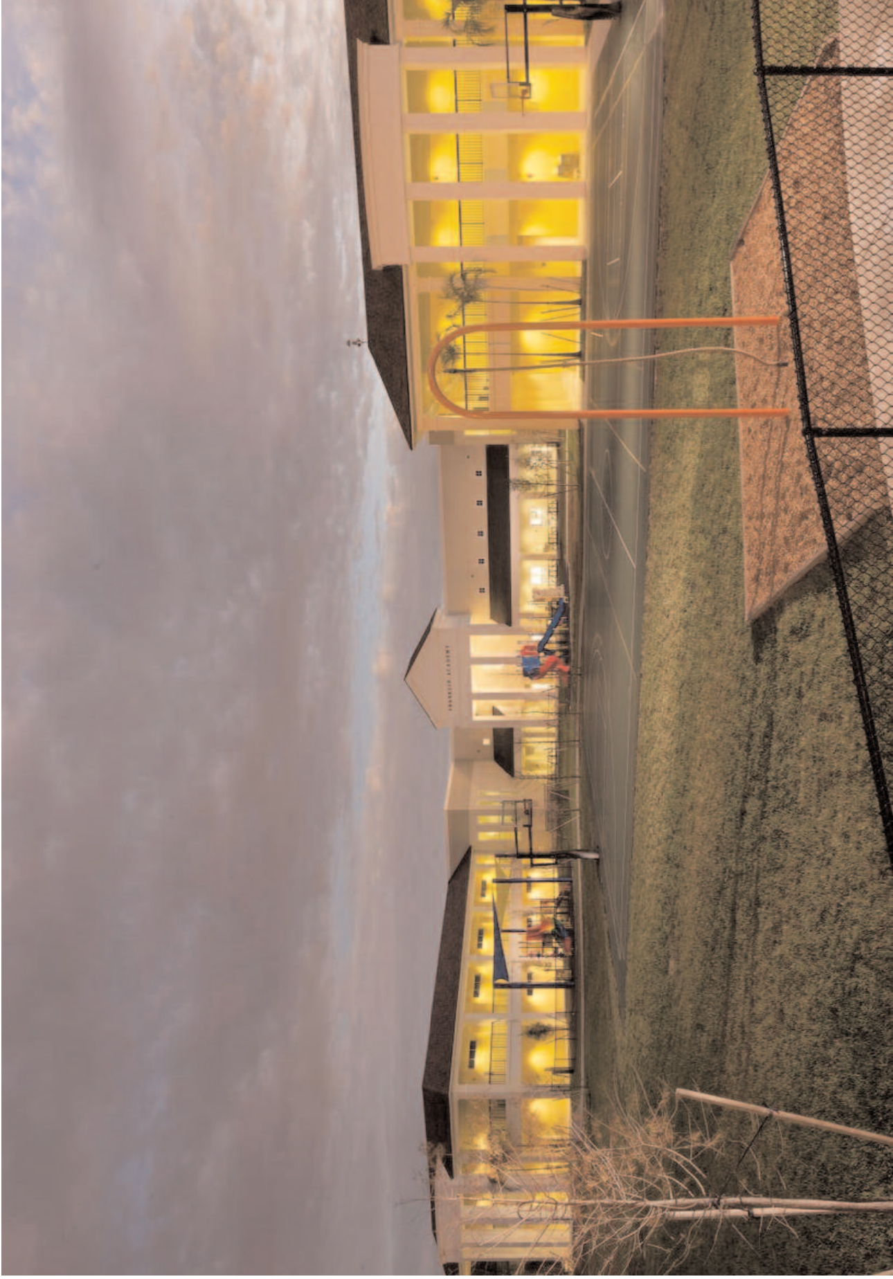
August 2011, Franklin Academy . Pembroke Pines, Fl. 70,000 sf education facilities on seven acres. The school has been built to accommodate 1,340 students, grades kindergarten through eighth grade. Total project cost $14,750,000.